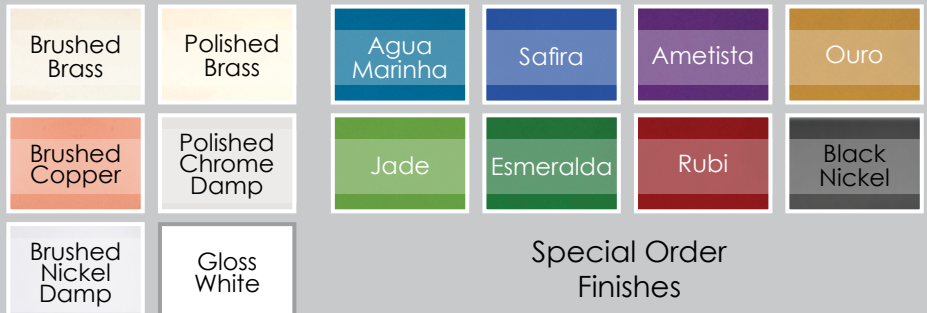
Special Order Finishes