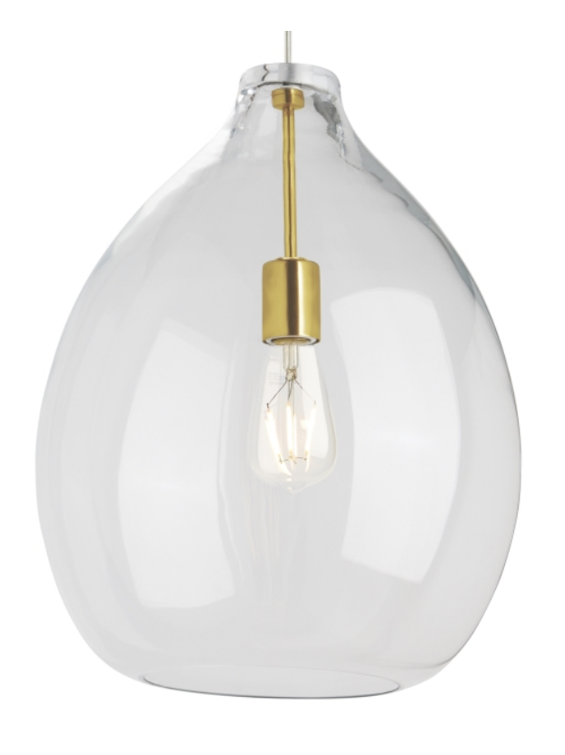
Clear/Natural Brass Incandescent