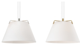
polished nickel / white