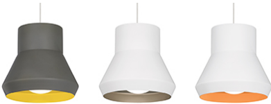
gray/chartreuse white/champagne white/orange