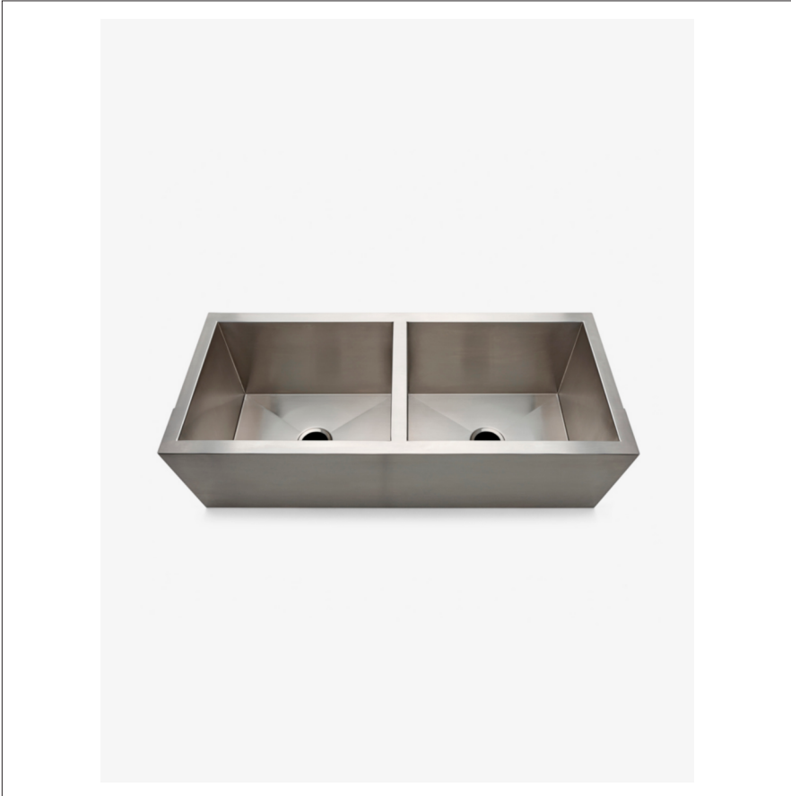
SHOWN IN KERR 47 11/16" X 21" X 14 5/8" TWIN STAINLESS STEEL RANCHHOUSE APRON KITCHEN SINK WITH CENTER

Kerr 47 11/16" x 21" x 14 5/8" Twin Stainless Steel Ranchhouse Apron Kitchen Sink with Center Drains