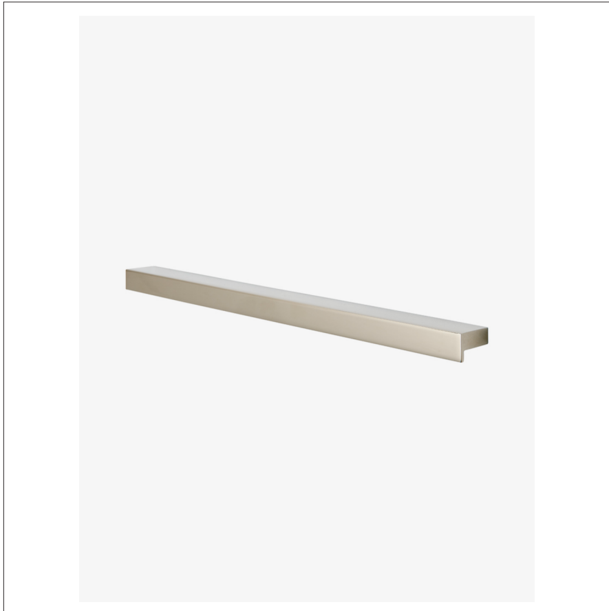
SHOWN IN APEX 12" PULL | AXHW12