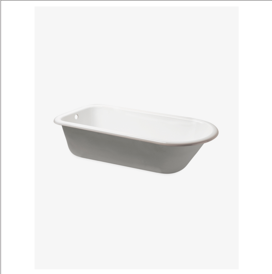
SHOWN IN SAXBY 70" X 30" X 19" DROP IN OVAL CAST IRON BATHTUB WITHOUT FEET| SABT90