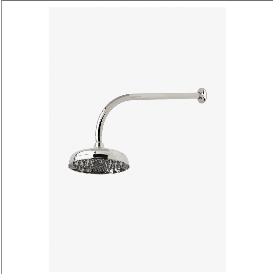
SHOWN IN OPUS 8" RAIN SHOWERHEAD WITH 18" WALL MOUNTED 90 DEGREE SHOWER ARM | OPS188

Opus 8" Rain Showerhead with 18" Wall Mounted 90 Degree Shower Arm